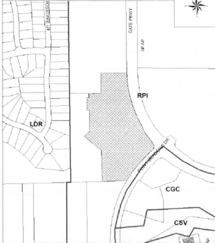
Pre-Adoption of L-5299-18C Land Use Map