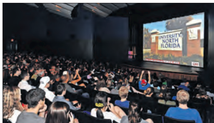
A coup for UNF. CNN held a Republican presidential debate on the campus of the University of North Florida in 2012.