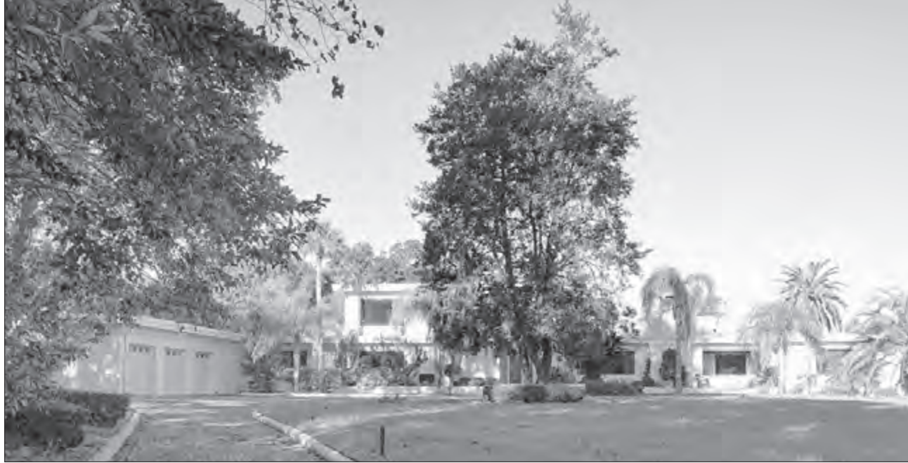
This home on Brookwood Road in San Marco is No. 1 of the 20 top homes for the Save Our Homes tax break in 2016. The market value was $6,856,731, but the assessed value because of Save Our Homes was $2,839,162, according to property appraiser records. The home sold in 2016 so it will reset to full market value in 2017 for its assessed value.

The inequity stems from the central idea behind Save Our Homes: the 3 percent cap on annual increases