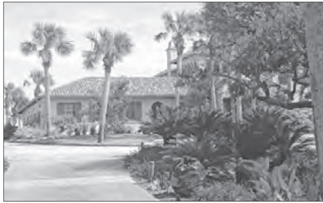
This home in the 4300 block of Duval Drive in Jacksonville Beach is No. 2 of the top 20 homes for the Save Our Homes tax breaks in 2016. The market value is $6,659,534, but the assessed value because of Save Our Homes is $3,056,379.

es in assessed value continues each year until there is a change in ownership. Then the cap goes away and the assessed value resets to full market value for the new owner.