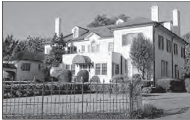
This home on Old Grove Manor in the Miramar neighborhood is No. 3 of the 20 top homes for the Save Our Homes tax breaks in 2016. The market value was $4,291,886, but the assessed value because of Save Our Homes was $1,377,134.

The Save Our Homes protection is for anyone who has a homestead exemption.