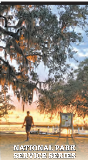
NATIONAL PARK SERVICE SERIES